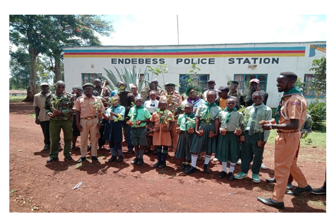
Western Kenya Region IPA members take part in the exercise