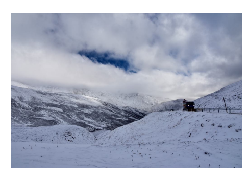
Yvonne McGregor IPA UK

As David and I reached the Perth & Kinross boundary at the top of 'The Slide' we caught up with a queue of traffic. Further investigation revealed a lorry travelling up the hill was stuck, a car was side on into the verge and the road was impassable. After about 40 minutes a snow plough appeared and after a few trips up and down the road a long line of traffic appeared. With the road now clear we set off and when we reached the Spittal, the road was clear and the sun came out. A very enjoyable day with new IPA Friends.